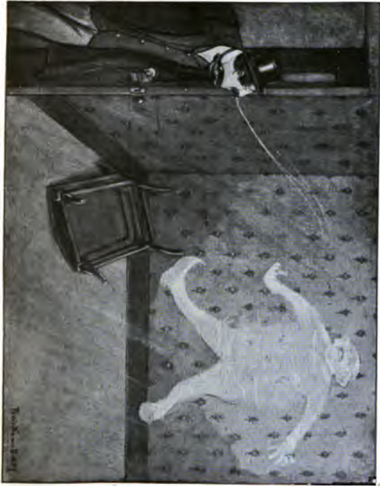
"PINNED HIM TO THE WALL LIKE A BUTTERFLY ON A CORK"